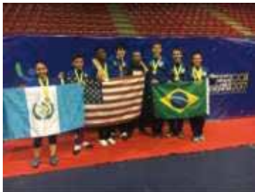
Some medalists 2017

2019 Organizador Interclubchampionship Americas Absolute Fencing 17 medals different categories in individual.